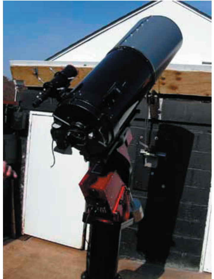
Ron Mittlestaedt's photos from the November 1, Workparty, where the new Paramount ME was installed on the pier and C-14 was mounted, aligned, and tested. For full color renditions of these photos, go to our website and view the PDF edition of the Times.