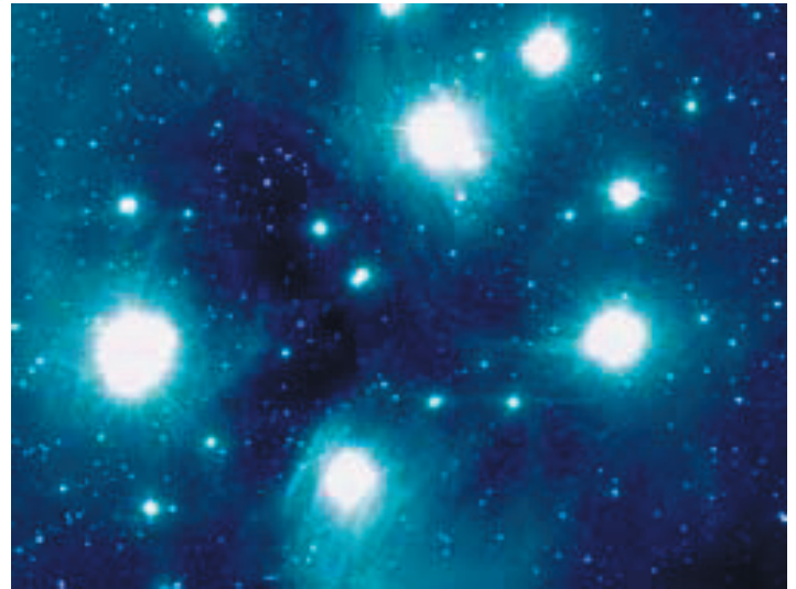
Bob Vanderbei's Images of M-42 and M-45