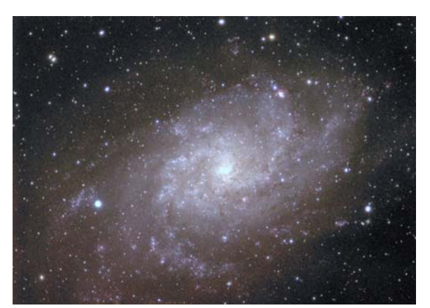
M33 also known as NGC 598.

NGC598 also known as M33 or the Pin Wheel Galaxy is one of the Local Group of galaxies including our own and M31. M33 lies in Triangulum and is over 50,000ly in diameter and some 3000kly distant. I have found this galaxy is only visually observable from a dark site as its 5.7mag is deceiving as it is spread out so much that it is very faint. When looking at images