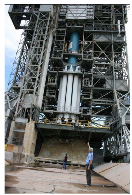
I am gazing at stacked Delta II with solid rocket motors at the launch pad sitting atop flame duct while awaiting ignition of Solid Rocket Motors.